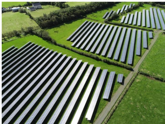
Lough Road Solar Farm; Greencoat Solar Fund II

In 2018, BCSSS invested £70 million in the “Greencoat Solar Fund II”, a fund created to acquire and oversee a collection of ground-mounted solar panels in the UK.